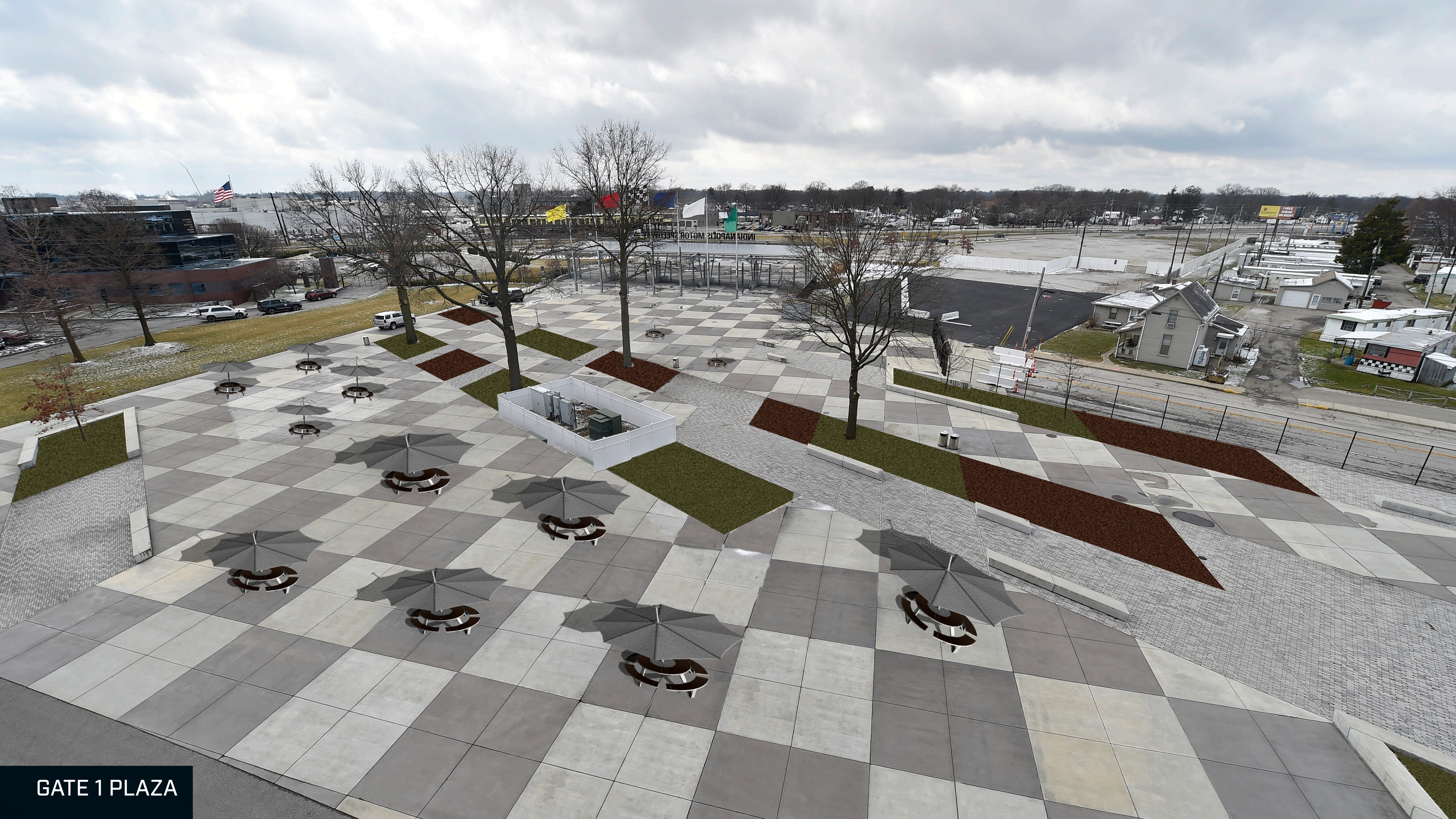
GATE 1 PLAZA